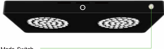
Factory Reset / Mode Switch

Hold 3 seconds to factory reset when you first connect the Aqua mini & Pro