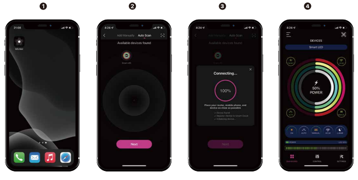
Download and open iMicMol APP to Add Device

Pairing (Please make sure your Bluetooth is turn on.)